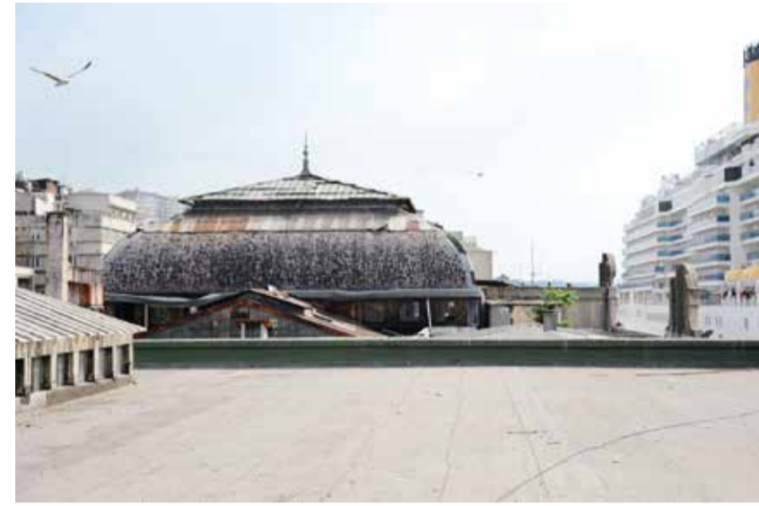
The large dome of the Paket Postanesi before restoration