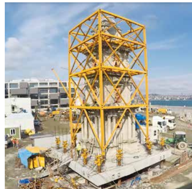
Tophane Clock Tower, located within Galataport Istanbul premises, was restored.

raised by 90 cm by the jacks which were placed underneath it and the foundation was casted under the tower. The first stage of the lifting took about three days. With the new foundation the tower was lifted 2 additional meters, and a second foundation was casted. Between those two foundations, 4 earthquake isolators were installed. The entire operation spanned approximately 5.5 months, encompassing the lifting of the tower, the correction of its obliquity, and the implementation of earthquake-proof measures. A particularly thrilling aspect of the process involved the unearthing of an additional storey that had been buried underground.