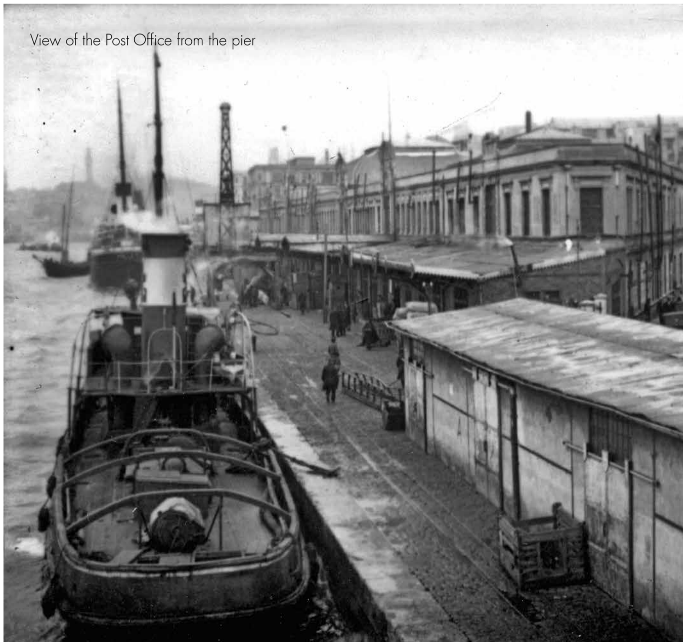
View of the Post Office from the pier

The Galata coast was known in ancient times as Sykai (Fig City). The Jewish community living in Galata during the Byzantine era are believed to be the Karaite Jews, and the area presently known as Karaköy was originally named Karay Village. Karaköy, a significant part of Galata town, first built in the 12th century by the Genoese, was home throughout history to Jews, the Genoese, Greeks, Romans, the French, and Venetians.