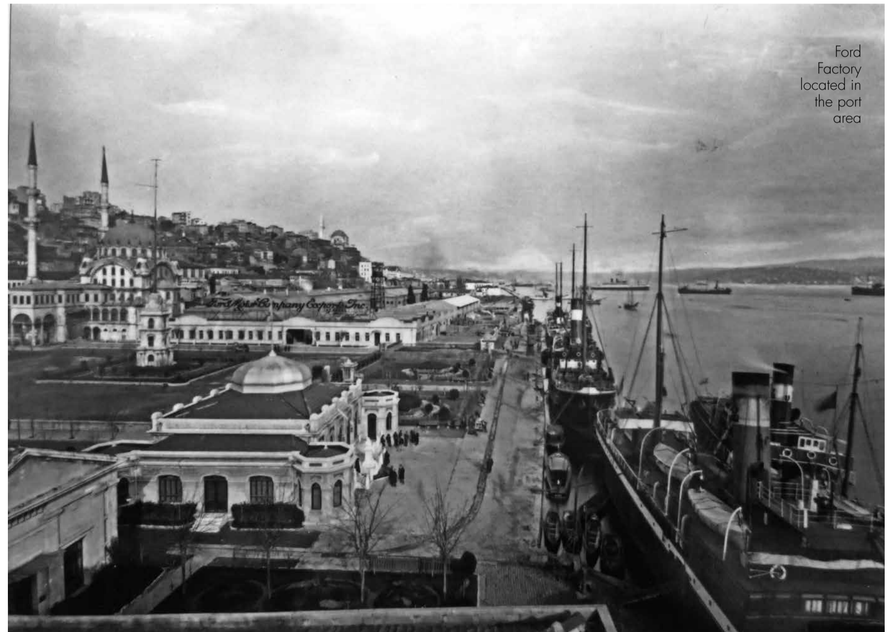
Ford Factory located in the port area

This area, which saw the arrival of the Ottomans as well with the conquest of Istanbul in 1453, transformed almost into a cradle of culture. Karaköy is one of Istanbul's most exquisite areas, where different nationalities, different faiths co-existed peacefully throughout history and understood one another despite speaking different languages. Due to its location, Galataport Istanbul is extremely rich in terms of historical heritage.