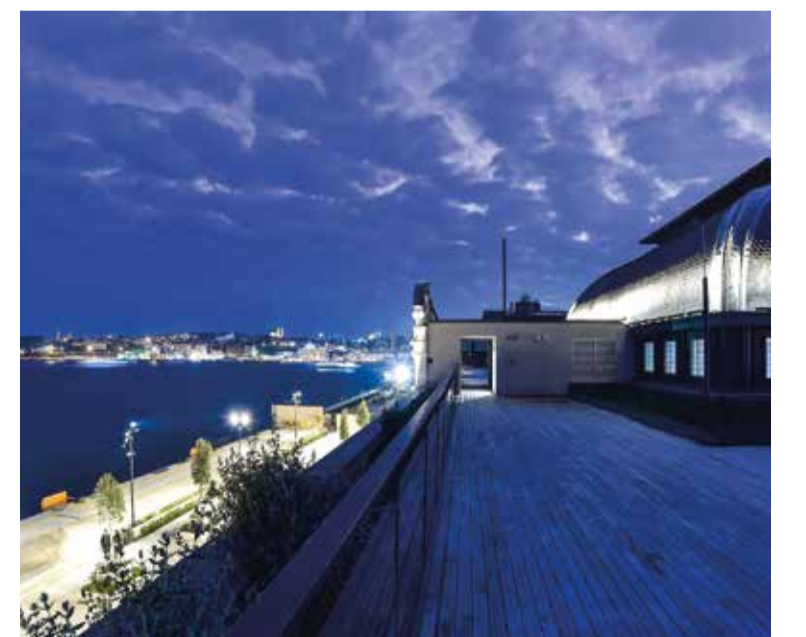
After undergoing restoration, the remaining three heritage buildings within the site, namely Merkez Han, Karaköy Passenger Hall, and Çini Han, have been transformed into The Peninsula Istanbul hotel. Notably, the restoration of Çini Han involved the meticulous refurbishment of an impressive 54,000 ceramic tiles, surpassing even the renowned Sultanahmet Mosque (Blue Mosque), which boasts a total of approximately 20,000 ceramic tiles.