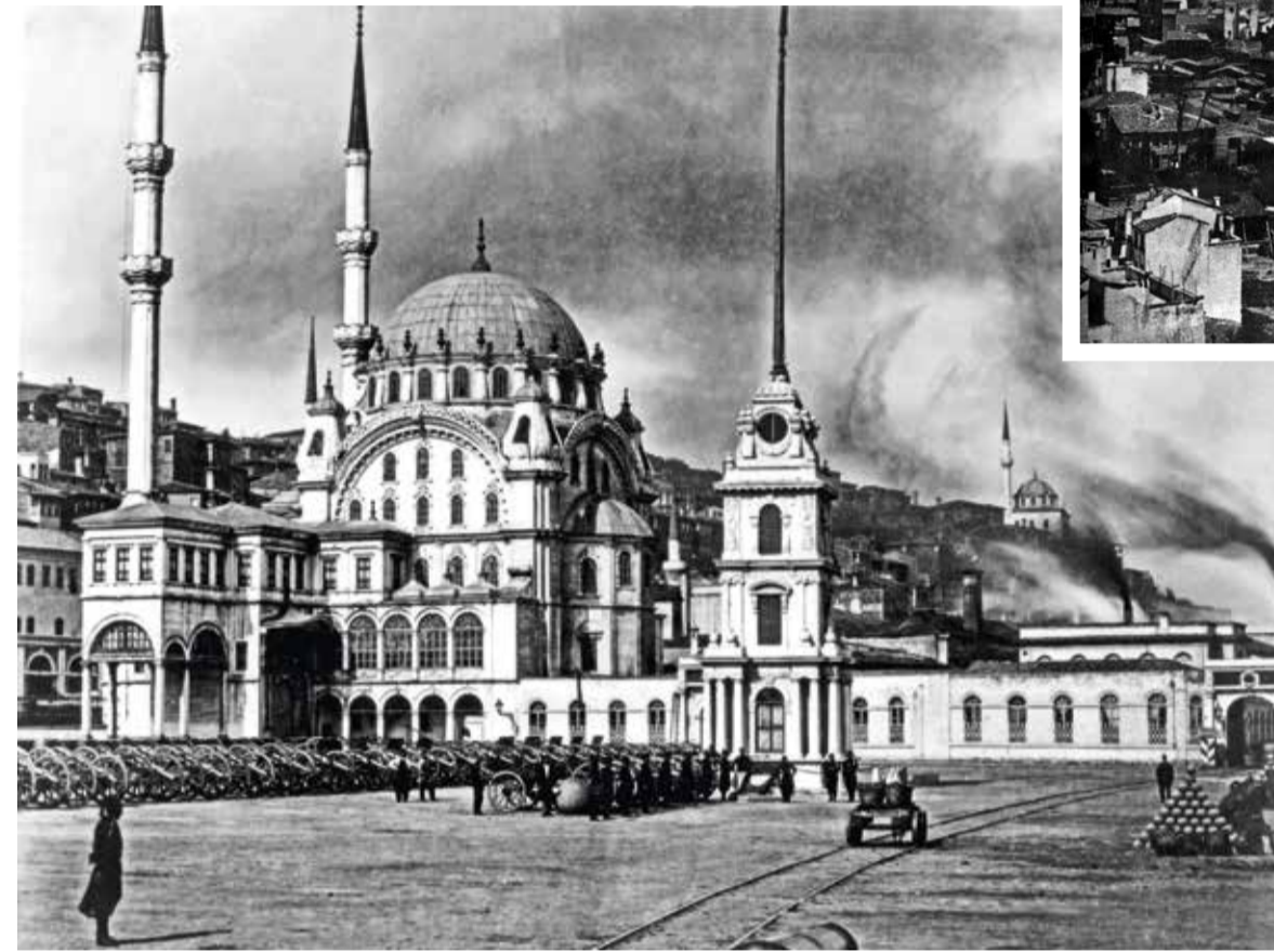
Tophane Clock Tower and Nusretiye Mosque