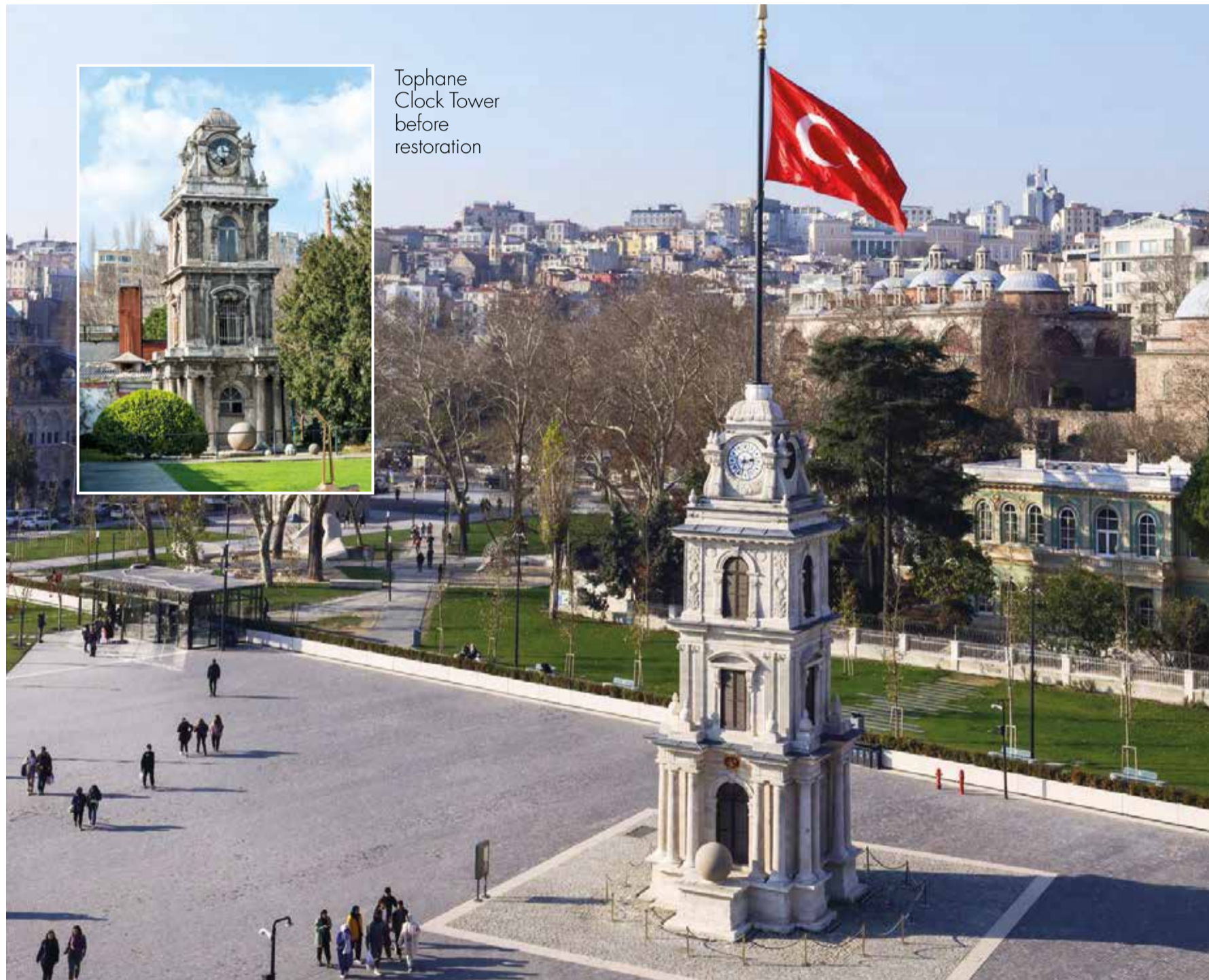
Tophane Clock Tower before restoration

Considering its location, Galataport Istanbul is also very rich in terms of historical heritage. The heritage buildings within the area were restored to return Istanbul's invaluable historical structures back to the city.